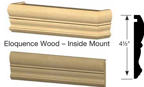
Eloquence Wood – Inside Mount

Note: Minimum return length is ½"; maximum return length is 8".