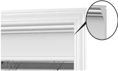
Full Recess Inside Mount Cornice

Inside Mount: Full Recess Window treatments are installed completely inside the window casing.